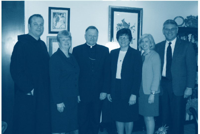
In May 2009 the NRVC Leadership Team met with NRVC Episcopal Liaison, Bishop Gregory M. Aymond, in Austin, TX. On August 20, 2009, Archbishop Aymond was installed as the 14th Archbishop of New Orleans. He is the first native son of New Orleans to serve as Archbishop in the history of the archdiocese.

May the Lord bless our labors in the promotion of vocations to religious life for the sake of building up the Body of Christ.