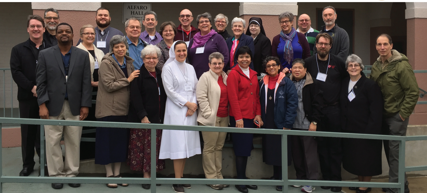
Participants at the Roots of Racism Workshop held at the Mexican American Catholic College in San Antonio, February 2018.