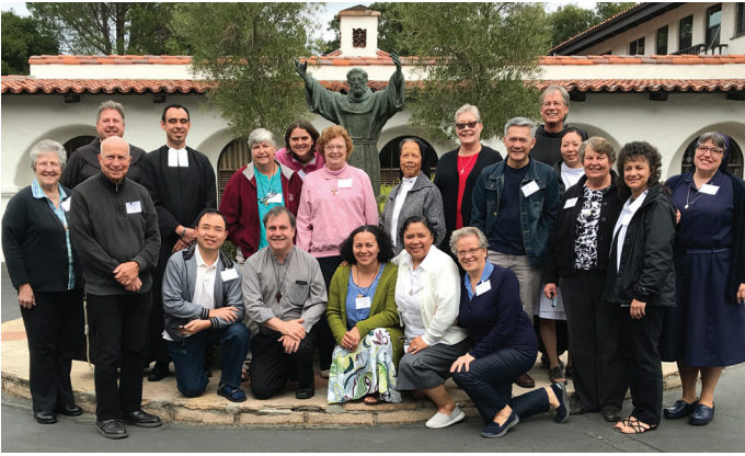
West Coast Member Area Members.