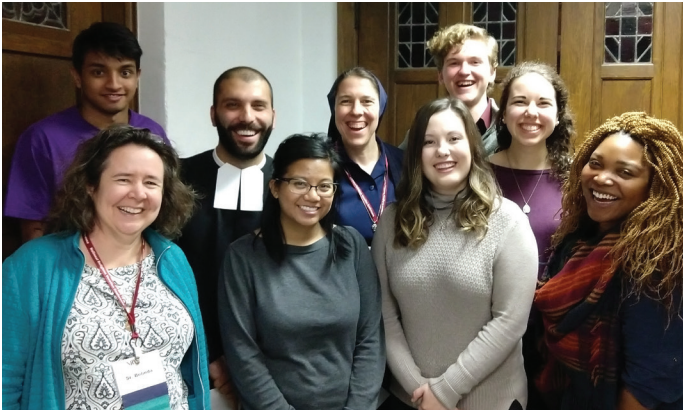
Above, emcees and participants at NRVC's youth-infused event, "You Talk. We'll Listen," held at Canisius College, Nov. 3, 2018.

Below, NRVC members snap a selfie at Convocation.