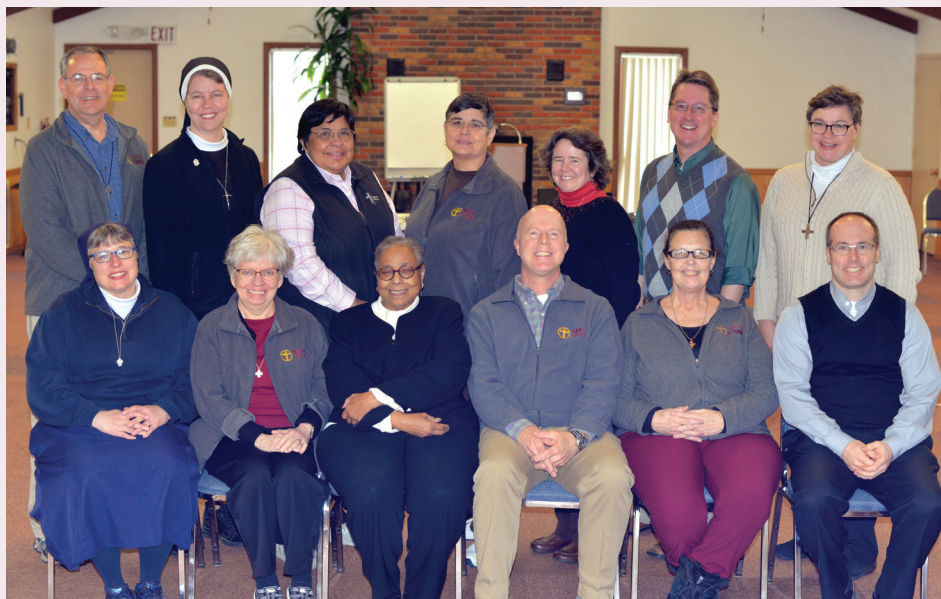
2018 NRVC National Board