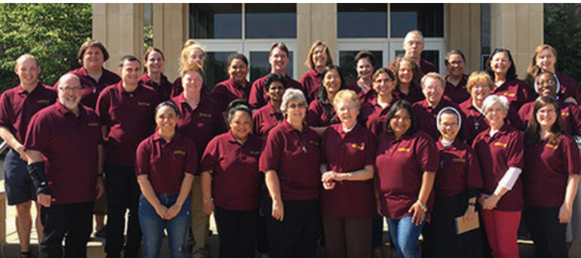
Participants in the 2017 Vocation Ambassadors program are ready to spread the word about religious life.