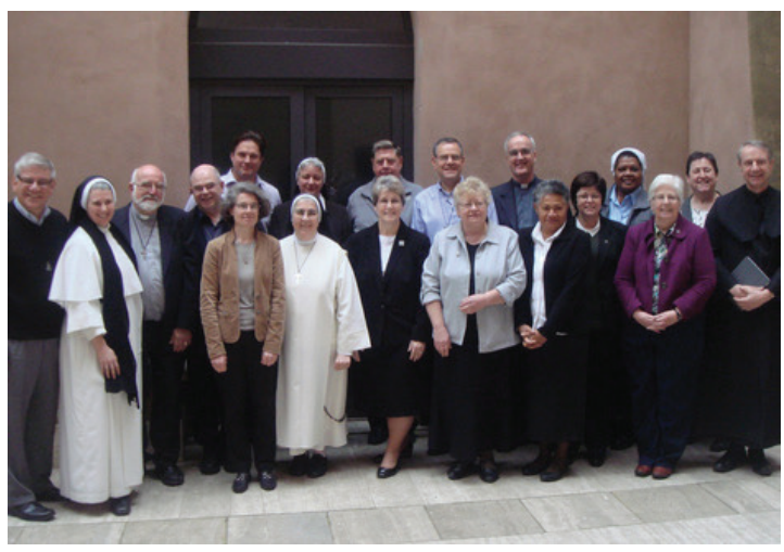
Vocation leaders met in February in Rome for the International Vocation Conference.

In response to the unique vocation challenges faced by the Western developed nations, NRVC hosted an unprecedented meeting of international vocation leaders to share vocation-related information, identify common needs and challenges, and explore future areas for worldwide collaboration in promoting vocations to consecrated life. Leaders from the United States, Canada, England/Wales, Ireland, France, Germany, Australia, the South Pacific Islands, and New Zealand participated in the three-day conference, which was held in February at the Istituto Maria Santissima Bambina, located