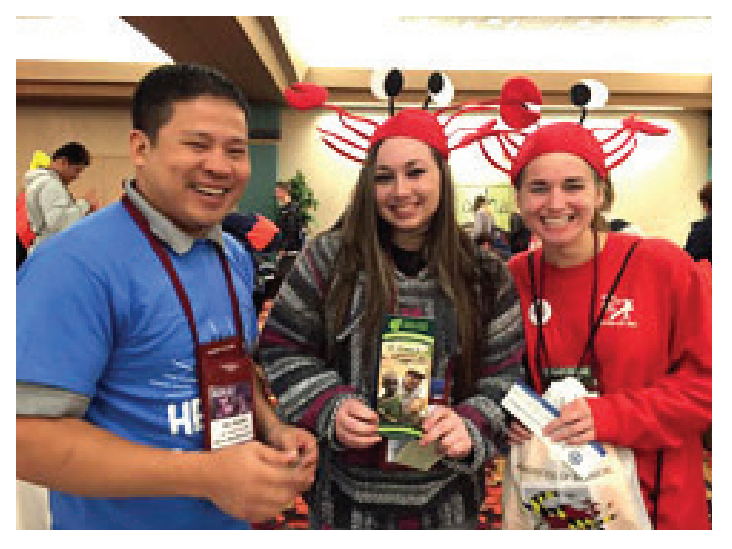
NRVC members representing 55 religious institutes took part in the National Catholic Youth Conference (NCYC) held November 19-21 in Indianapolis.

NRVC is grateful to the GHR Foundation for funding the Today's Catholic Sisters symposia and to the four universities for co-hosting the events.