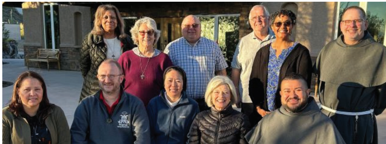
NRVC Board Members in December 2023.