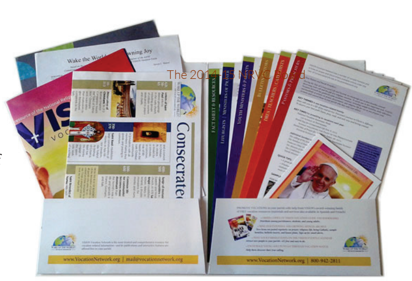
VISION editors produced a Year of Consecrated Life Parish Resource Packet that was distributed to NRVC members as well as every U.S. parish and bishop. Contents included material for homilists, bulletin editors, liturgists, directors of religious education, youth ministers, and parents.

VISION remains the most comprehensive vocation discernment resource available in print and online. In addition to increasing the social engagement of its readers in 2014, VISION also received recognition from the Associated Church Press and the Catholic Press Association for its 2014 print and online offerings.