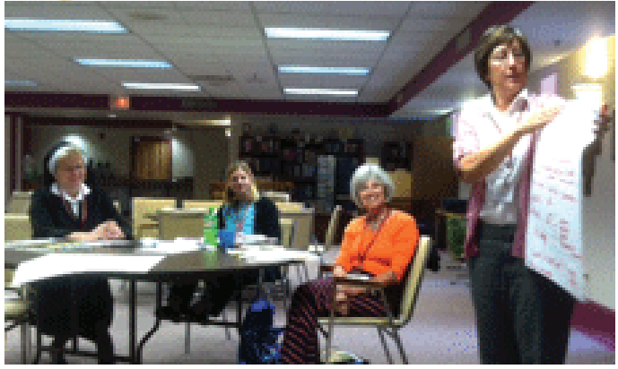
Regional coordinators gathered to look at proposed bylaw changes and provide member feedback to the NRVC staff.

also held focus groups with culturally diverse men and women in formation. The complete report, Incorporating Multicultural Diversity in Religious Life: A Report for the National Religious Vocation Conference, and other related resources can be found on the NRVC website.