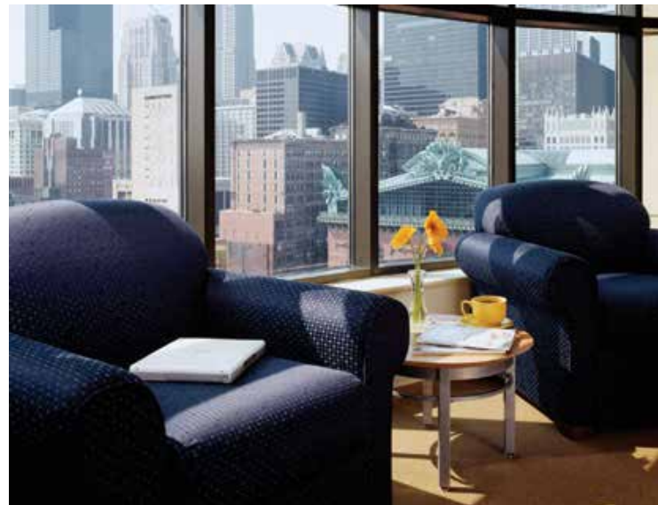
Above, a view from inside an apartment suite at University Center.

Overnight accommodations are available at the University Center, which is just two blocks from DePaul University. Enjoy the convenience of having your workshop close to restaurants, shopping, museums and Lake Michigan. The University Center offers private bedrooms in a four person apartment suite with other NRVC workshop participants. Weekly linen service is included as well as an in-room microwave, stove, and refrigerator. Each apartment suite also contains a flat screen TV with basic cable and complimentary internet access. For more information, visit http://universitycenter.com/inside/ . Limited rooms are available; make your overnight accommodations when you register online for your workshop. Please do not call the University Center for reservations.