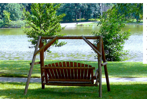
Enjoy a walk on campus including mowed paths around the lake.