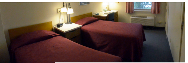
Bedrooms provide linens and towels, a private bath with shower, individually controlled heating and air conditioning, and WiFi.