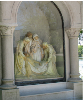
Outdoor Stations of the Cross are located west of Lindenwood next to Lake Gilbraith.