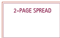
2-PAGE SPREAD: 15" x 10" TRIM SIZE: 17" x 11"