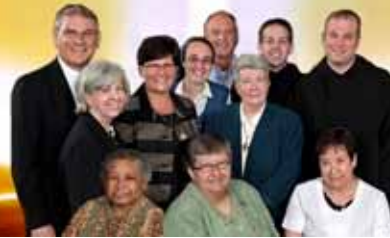
NRVC BOARD MEMBERS

NRVC National Religious Vocation Conference